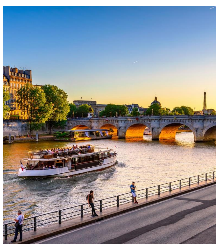
7 Days • 8 Meals: 5 Breakfasts, 3 Dinners

HIGHLIGHTS... Seine River Dinner Cruise, Louvre Museum, Le Marais, Place des Vosges, Notre Dame, Versailles Palace & Gardens, Montmartre, Champs-Elysees, Arc de Triomphe, Choice on Tour: Sacre Coeur & Free Time in Montmartre or Musee de Montmartre, Eiffel Tower Dinner