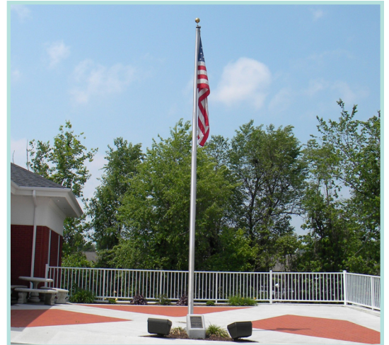
Flagpole and Patio