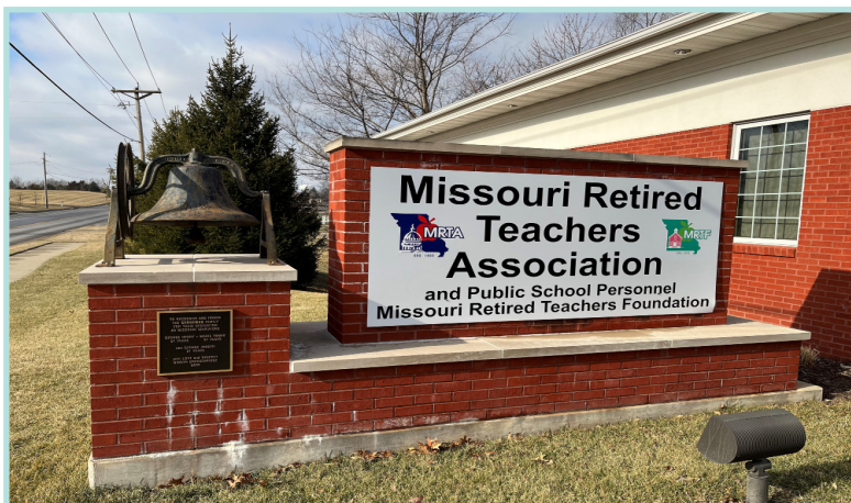
MRTA/MRTF - Marquee Sign