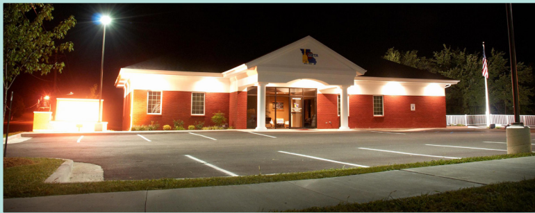
Picture of MRTF Building at Night