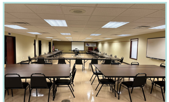
The Classroom and Learning Center

Honoring the past and giving to the future